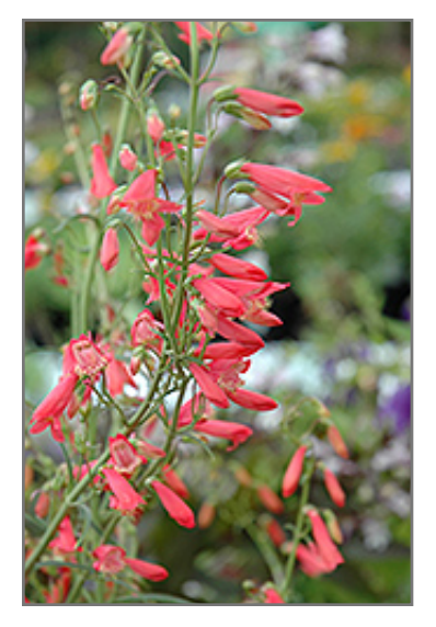
Jingle Bells Beard Tongue flowers

An attractive strong plant with large eye-catching rose-pink flowers that emerge with a flush of red; excellent for massing in drier, sunny areas