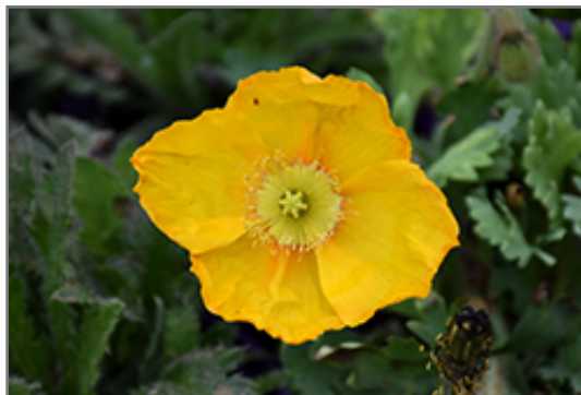
Spring Fever Yellow Poppy flowers

Spring Fever Yellow Poppy is recommended for the following landscape applications;