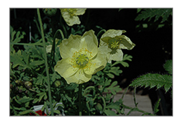
Pacino Poppy flowers