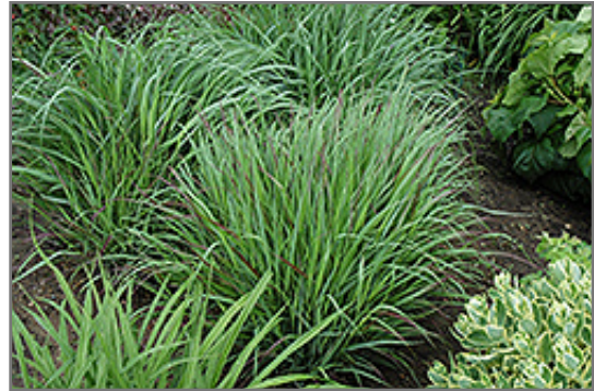
Cheyenne Sky Switch Grass

Cheyenne Sky Switch Grass will grow to be about 24 inches tall at maturity extending to 3 feet tall with the flowers, with a spread of 24 inches. It tends to be leggy, with a typical clearance of 1 foot from the ground, and should be underplanted with lower-growing perennials. It grows at a medium rate, and under ideal conditions can be expected to live for approximately 15 years. As an herbaceous perennial, this plant will usually die back to the crown each winter, and will regrow from the base each spring. Be careful not to disturb the crown in late winter when it may not be readily seen!