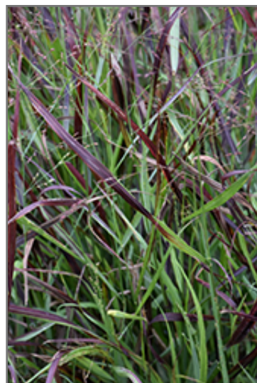
Cheyenne Sky Switch Grass flowers