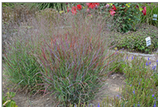
Cheyenne Sky Switch Grass

Cheyenne Sky Switch Grass is recommended for the following landscape applications;