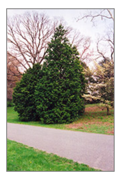
Hinoki Falsecypress

Hinoki Falsecypress is primarily valued in the landscape for its distinctively pyramidal habit of growth. It has dark green evergreen foliage. The scale-like sprays of foliage remain dark green throughout the winter. The shaggy antique red bark adds an interesting dimension to the landscape.