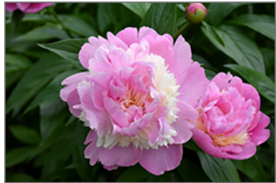
Sorbet Peony flowers