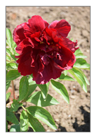
Henry Bockstoce Peony flowers