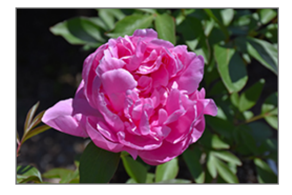
Dr. Alexander Fleming Peony flowers