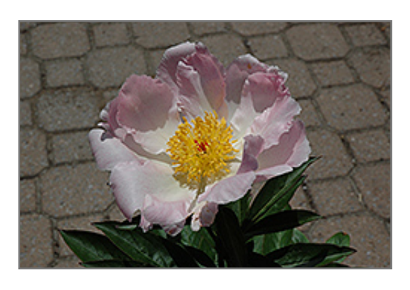
Charles Burgess Peony flowers

This visually stunning peony will create a dramatic late spring display in garden and border plantings; burgundy-red semi-double blooms, with a dazzling ring of stamenoids edged in butter yellow in the center; an excellent cut flower