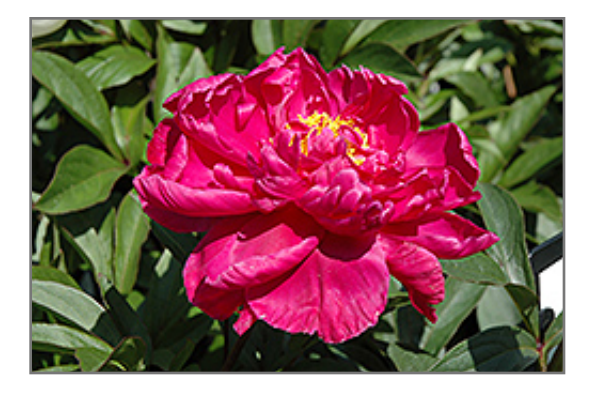
Benjamin Franklin Peony flowers