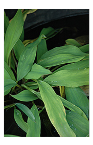
Golden Club foliage

Golden Club features unusual spikes of white tubular flowers with yellow tips rising above the foliage from early to late spring. Its large narrow leaves remain bluish-green in colour throughout the season.