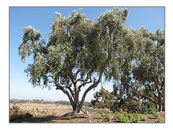
Common Olive