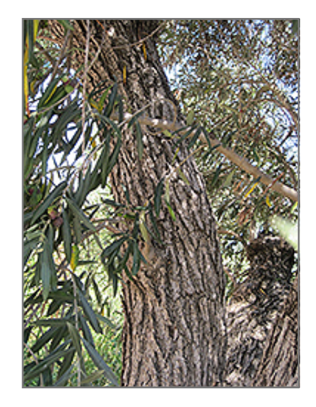
Common Olive bark

Common Olive will grow to be about 30 feet tall at maturity, with a spread of 25 feet. It has a low canopy with a typical clearance of 2 feet from the ground, and should not be planted underneath power lines. It grows at a slow rate, and under ideal conditions can be expected to live to a ripe old age of 300 years or more; think of this as a heritage tree for future generations!