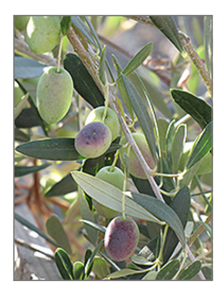
Common Olive fruit