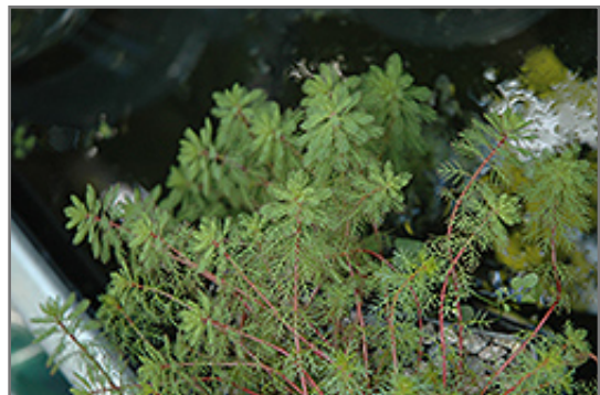
Red Stemmed Parrot Feather foliage