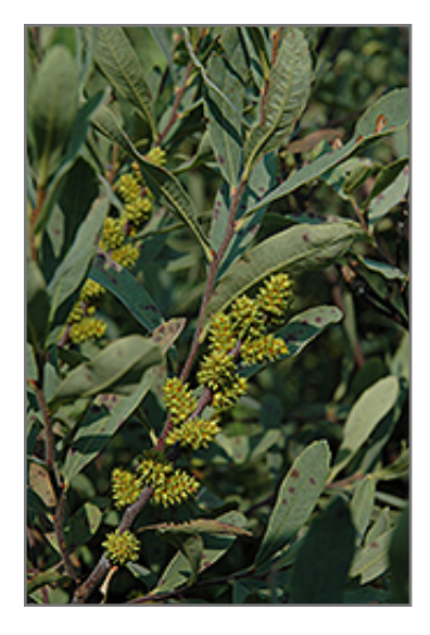
Sweet Gale flowers

This shrub will require occasional maintenance and upkeep, and may require the occasional pruning to look its best. It is a good choice for attracting birds, bees and butterflies to your yard. Gardeners should be aware of the following characteristic(s) that may warrant special consideration;