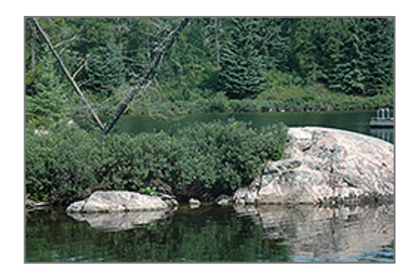
Sweet Gale