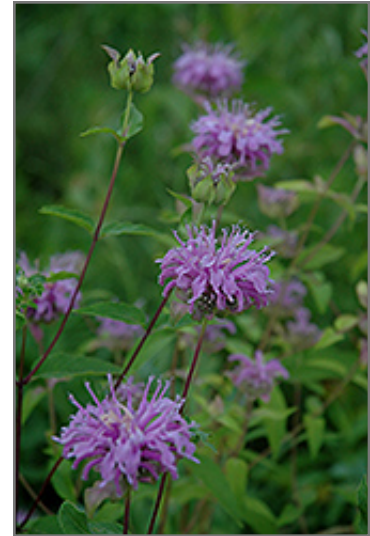
Wild Beebalm flowers