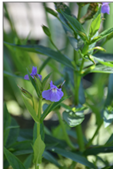
Allegheny Monkey Flower flowers