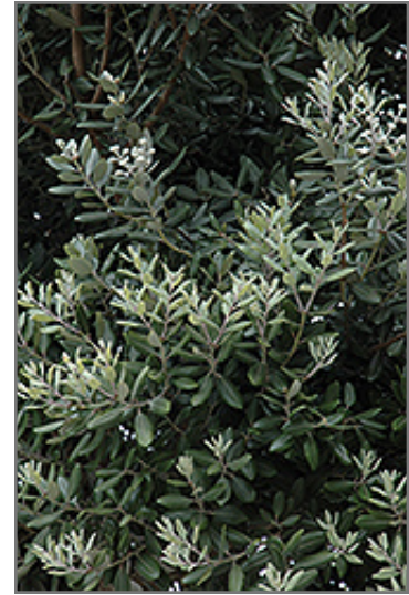
Pohutukawa foliage

This tree should only be grown in full sunlight. It does best in average to evenly moist conditions, but will not tolerate standing water. It is particular about its soil conditions, with a strong preference for rich, acidic soils, and is able to handle environmental salt. It is somewhat tolerant of urban pollution, and will benefit from being planted in a relatively sheltered location. This species is not originally from North America.