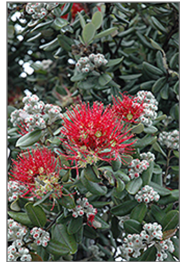
Pohutukawa flowers