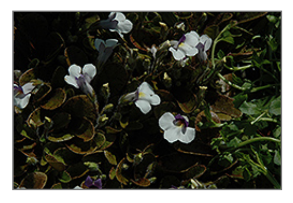
Freckled Mazus flowers