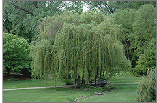
Golden Curls Willow

Golden Curls Willow will grow to be about 25 feet tall at maturity, with a spread of 20 feet. It has a low canopy with a typical clearance of 2 feet from the ground, and is suitable for planting under power lines. It grows at a fast rate, and under ideal conditions can be expected to live for 40 years or more.