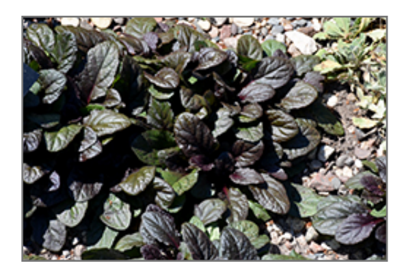
Gaiety Bugleweed

This plant will require occasional maintenance and upkeep, and should not require much pruning, except when necessary, such as to remove dieback. It is a good choice for attracting butterflies to your yard, but is not particularly attractive to deer who tend to leave it alone in favor of tastier treats. Gardeners should be aware of the following characteristic(s) that may warrant special consideration;