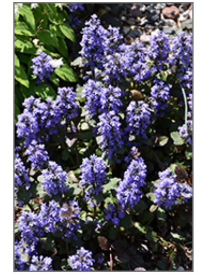
Gaiety Bugleweed flowers

Gaiety Bugleweed is a dense herbaceous evergreen perennial with a ground-hugging habit of growth. Its medium texture blends into the garden, but can always be balanced by a couple of finer or coarser plants for an effective composition.