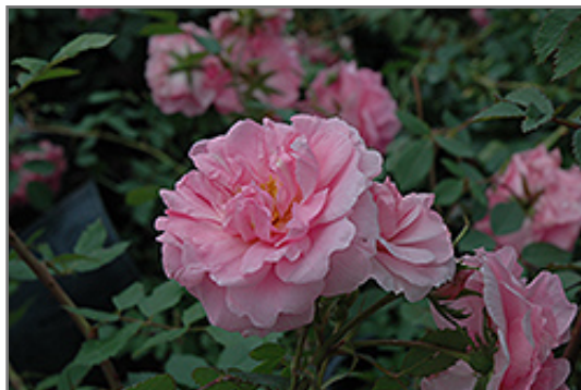
John Davis Rose flowers

John Davis Rose is recommended for the following landscape applications;