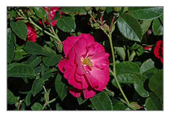
John Cabot Rose flowers

John Cabot Rose is draped in stunning fragrant semi-double fuchsia flowers with hot pink overtones and yellow eyes along the branches from late spring to late summer. The flowers are excellent for cutting. It has dark green deciduous foliage. The oval compound leaves turn yellow in fall. The fruits are showy orange hips displayed from mid to late fall. The spiny brick red bark adds an interesting dimension to the landscape.