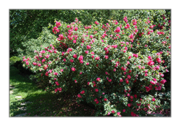
John Cabot Rose in bloom