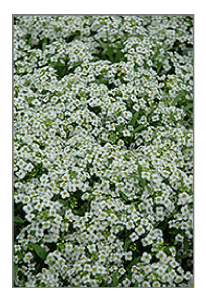
Wonderland White Alyssum flowers

This plant will require occasional maintenance and upkeep, and should not require much pruning, except when necessary, such as to remove dieback. It is a good choice for attracting bees and butterflies to your yard, but is not particularly attractive to deer who tend to leave it alone in favor of tastier treats. It has no significant negative characteristics.