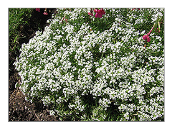
Wonderland White Alyssum in bloom

Wonderland White Alyssum is recommended for the following landscape applications;