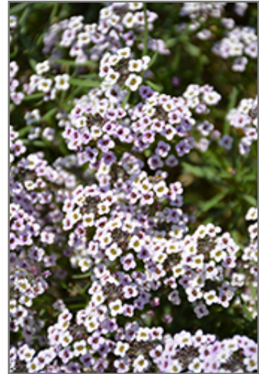
Blushing Princess Sweet Alyssum flowers

Blushing Princess Sweet Alyssum is a fine choice for the garden, but it is also a good selection for planting in hanging baskets. Because of its trailing habit of growth, it is ideally suited for use as a 'spiller' in the 'spiller-thriller-filler' container combination; plant it near the edges where it can spill gracefully over the pot. Note that when growing plants in outdoor containers and baskets, they may require more frequent waterings than they would in the yard or garden.