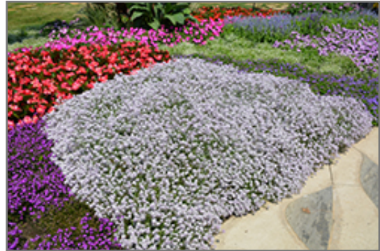
Blushing Princess Sweet Alyssum in bloom

Blushing Princess Sweet Alyssum is a fine choice for the garden, but it is also a good selection for planting in hanging baskets. Because of its trailing habit of growth, it is ideally suited for use as a 'spiller' in the 'spiller-thriller-filler' container combination; plant it near the edges where it can spill gracefully over the pot. Note that when growing plants in outdoor containers and baskets, they may require more frequent waterings than they would in the yard or garden.