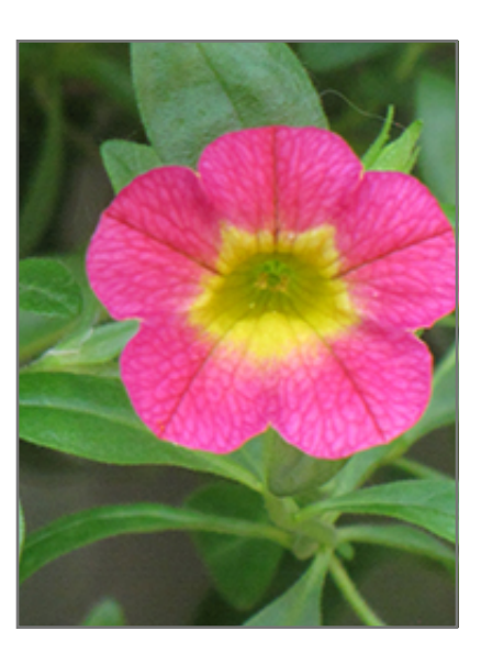
Superbells Sweet Tart Calibrachoa flowers

Beautiful brightly colored, small petunia-like flowers in single or double blooms, solid or patterned, cascade from vigorous mounded-semi trailing plants; heat tolerant and low maintenance, perfect for hanging baskets and patio containers