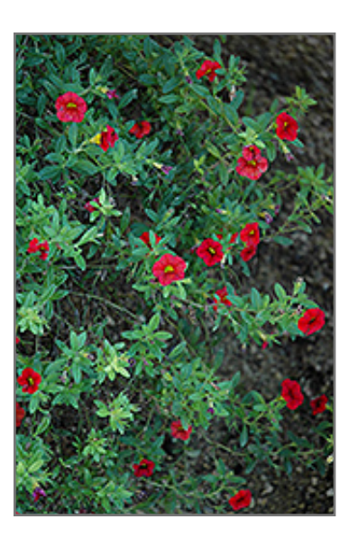
Superbells Scarlet Calibrachoa flowers

Beautiful brightly colored, small petunia-like flowers in single or double blooms, solid or patterned, cascade from vigorous mounded-semi trailing plants; heat tolerant and low maintenance, perfect for hanging baskets and patio containers