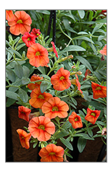
Superbells Dreamsicle Calibrachoa flowers

This plant will require occasional maintenance and upkeep. Trim off the flower heads after they fade and die to encourage more blooms late into the season. It is a good choice for attracting bees and hummingbirds to your yard, but is not particularly attractive to deer who tend to leave it alone in favor of tastier treats. It has no significant negative characteristics.