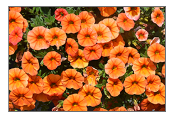
Superbells Dreamsicle Calibrachoa flowers

Superbells Dreamsicle Calibrachoa is a dense herbaceous annual with a trailing habit of growth, eventually spilling over the edges of hanging baskets and containers. Its medium texture blends into the garden, but can always be balanced by a couple of finer or coarser plants for an effective composition.