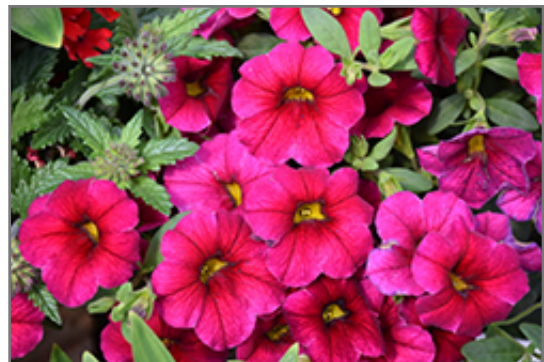
Superbells Cherry Red Calibrachoa flowers