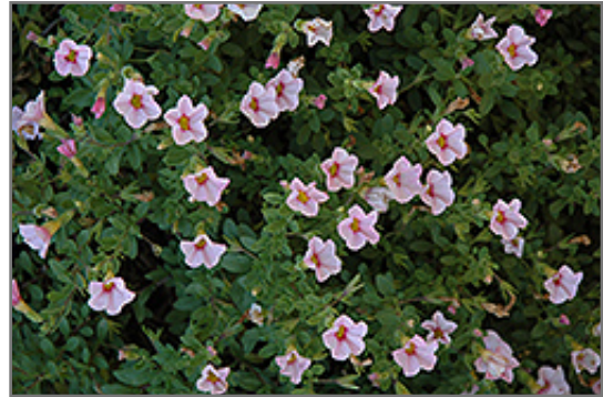
Superbells Cherry Blossom Calibrachoa flowers

Superbells Cherry Blossom Calibrachoa is recommended for the following landscape applications;