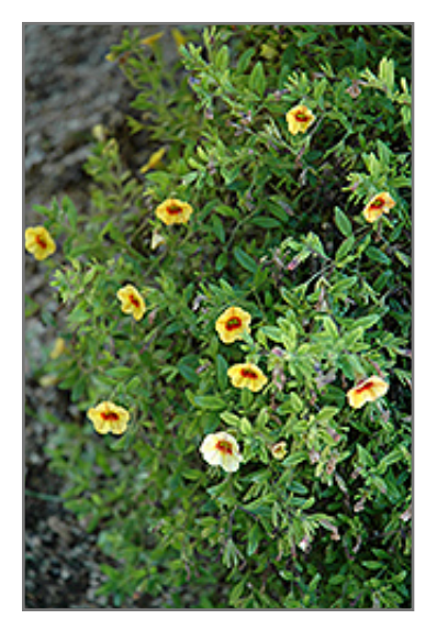
Superbells Apricot Punch Calibrachoa flowers

Beautiful brightly colored, small petunia-like flowers in single or double blooms, solid or patterned, cascade from vigorous mounded-semi trailing plants; heat tolerant and low maintenance, perfect for hanging baskets and patio containers