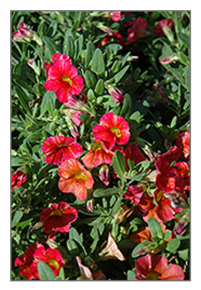
Superbells Tequila Sunrise Calibrachoa flowers

Beautiful brightly colored, small petunia-like flowers in single or double blooms, solid or patterned, cascade from vigorous mounded-semi trailing plants; heat tolerant and low maintenance, perfect for hanging baskets and patio containers