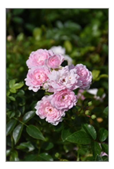
The Fairy Rose flowers