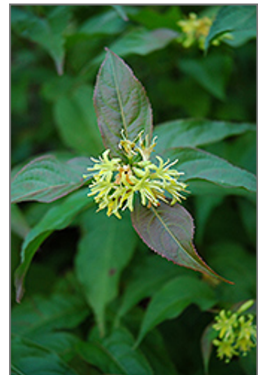
Bush Honeysuckle flowers