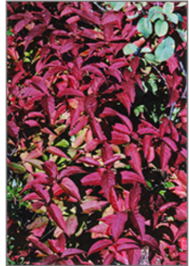
Bush Honeysuckle in fall

This shrub does best in full sun to partial shade. It is very adaptable to both dry and moist locations, and should do just fine under average home landscape conditions. It is not particular as to soil type or pH. It is highly tolerant of urban pollution and will even thrive in inner city environments. This species is native to parts of North America.