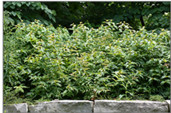
Bush Honeysuckle