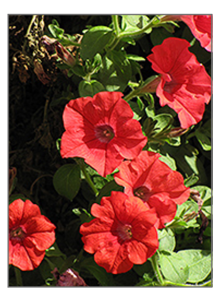
Supertunia Red Petunia flowers

Supertunia Red Petunia is clothed in stunning red trumpet-shaped flowers at the ends of the stems from mid spring to mid fall. Its pointy leaves remain green in colour throughout the season.