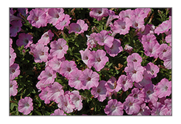
Supertunia Pink Charm Petunia flowers