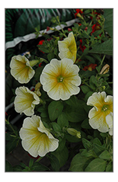
Supertunia Citrus Petunia flowers

Supertunia Citrus Petunia is covered in stunning buttery yellow trumpet-shaped flowers with white edges at the ends of the stems from mid spring to mid fall. Its pointy leaves remain green in colour throughout the season.