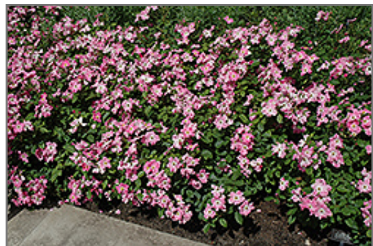
Nearly Wild Rose in bloom