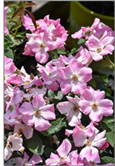
Nearly Wild Rose flowers