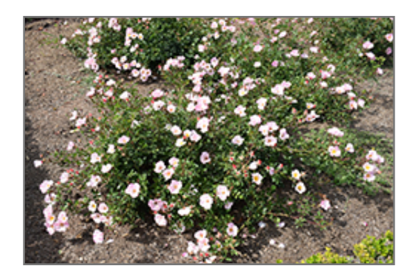
Carefree Delight Rose in bloom