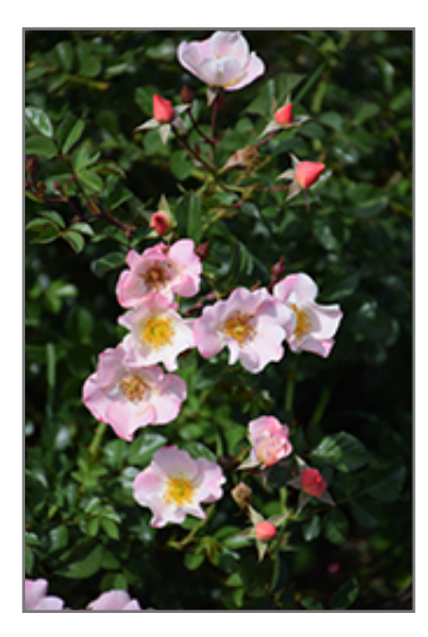
Carefree Delight Rose flowers

This shrub will require occasional maintenance and upkeep, and is best pruned in late winter once the threat of extreme cold has passed. Gardeners should be aware of the following characteristic(s) that may warrant special consideration;