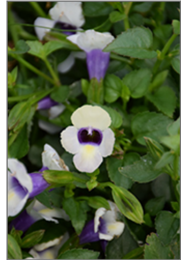
Catalina Grape-O-Licious Torenia flowers

This plant will require occasional maintenance and upkeep, and should not require much pruning, except when necessary, such as to remove dieback. It is a good choice for attracting bees and hummingbirds to your yard, but is not particularly attractive to deer who tend to leave it alone in favor of tastier treats. It has no significant negative characteristics.