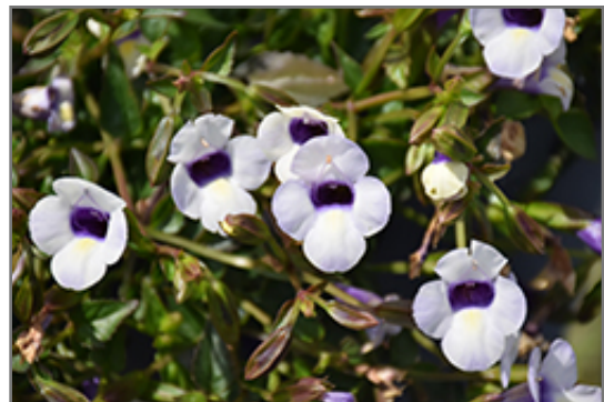
Catalina Grape-O-Licious Torenia flowers