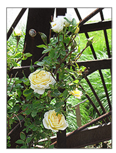
J.P. Connell Rose flowers

J.P. Connell Rose is recommended for the following landscape applications;