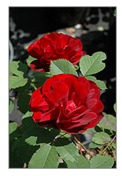
Hope for Humanity Rose flowers

Hope for Humanity Rose is recommended for the following landscape applications;