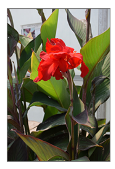
Black Knight Canna flowers

This plant should only be grown in full sunlight. It prefers to grow in moist to wet soil, and will even tolerate some standing water. It is not particular as to soil type or pH. It is highly tolerant of urban pollution and will even thrive in inner city environments. Consider applying a thick mulch around the root zone in winter to protect it in exposed locations or colder microclimates. This particular variety is an interspecific hybrid. It can be propagated by division; however, as a cultivated variety, be aware that it may be subject to certain restrictions or prohibitions on propagation.