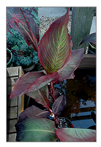
Black Knight Canna foliage