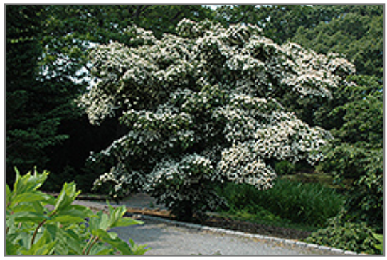
Big Apple Chinese Dogwood in bloom