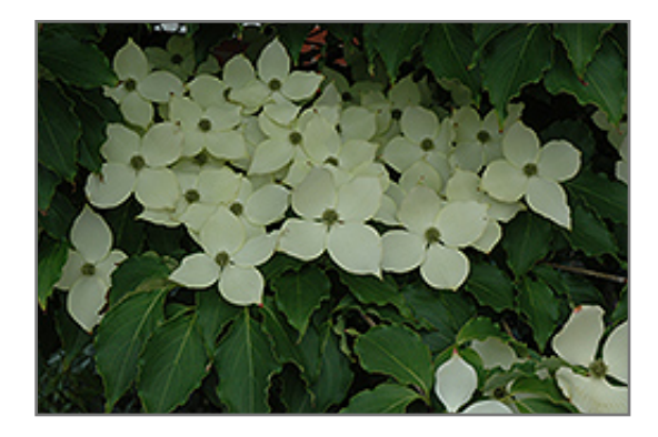
Big Apple Chinese Dogwood flowers

Big Apple Chinese Dogwood is recommended for the following landscape applications;