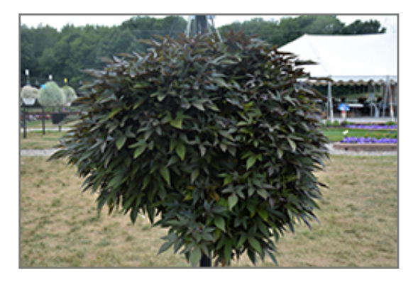
Sidekick Black Sweet Potato Vine