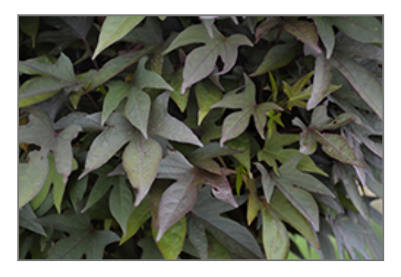
Sidekick Black Sweet Potato Vine foliage