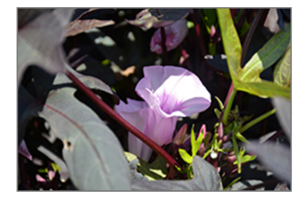
Sidekick Black Sweet Potato Vine flowers

This plant does best in full sun to partial shade. You may want to keep it away from hot, dry locations that receive direct afternoon sun or which get reflected sunlight, such as against the south side of a white wall. It does best in average to evenly moist conditions, but will not tolerate standing water. It is not particular as to soil type or pH. It is somewhat tolerant of urban pollution. This is a selected variety of a species not originally from North America. It can be propagated by cuttings; however, as a cultivated variety, be aware that it may be subject to certain restrictions or prohibitions on propagation.