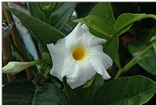
Bride's Cascade Mandevilla flowers

This plant does best in full sun to partial shade. It requires an evenly moist well-drained soil for optimal growth. It is not particular as to soil type or pH. It is highly tolerant of urban pollution and will even thrive in inner city environments. This particular variety is an interspecific hybrid, and parts of it are known to be toxic to humans and animals, so care should be exercised in planting it around children and pets. It can be propagated by cuttings; however, as a cultivated variety, be aware that it may be subject to certain restrictions or prohibitions on propagation.