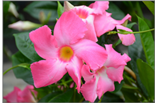
Sun Parasol Pretty Pink Mandevilla flowers

This plant is native to the tropics and prefers growing in moist environments with evenly warm conditions all year round. In our climate, it is usually grown as an outdoor annual in the garden or in a container. If you want it to survive the winter, it can be brought in to the house and provided with special care, and then returned to the garden the following season. In its preferred tropical habitat, it can grow to be around 10 feet tall at maturity, with a spread of 24 inches. However, when grown as an annual or when overwintered indoors, it can be expected to perform differently, and its exact height and spread will depend on many factors; you may wish to consult with our experts as to how it might perform in your specific application and growing conditions.