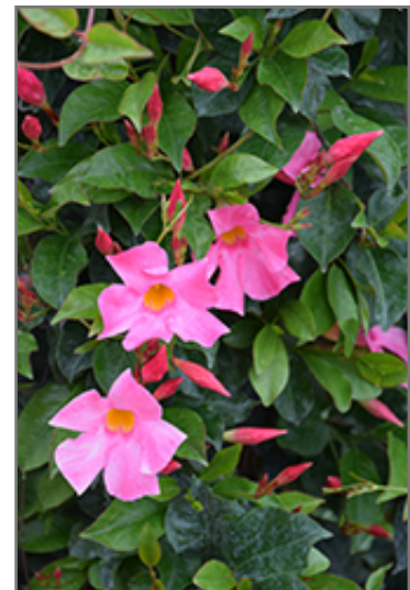
Sun Parasol Pretty Pink Mandevilla flowers