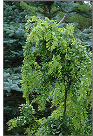
Twisted Baby Black Locust foliage

This shrub does best in full sun to partial shade. It is very adaptable to both dry and moist growing conditions, but will not tolerate any standing water. It is not particular as to soil type or pH, and is able to handle environmental salt. It is highly tolerant of urban pollution and will even thrive in inner city environments. This is a selection of a native North American species.