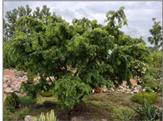
Twisted Baby Black Locust

This is a high maintenance shrub that will require regular care and upkeep, and is best pruned in late winter once the threat of extreme cold has passed. Deer don't particularly care for this plant and will usually leave it alone in favor of tastier treats. Gardeners should be aware of the following characteristic(s) that may warrant special consideration;