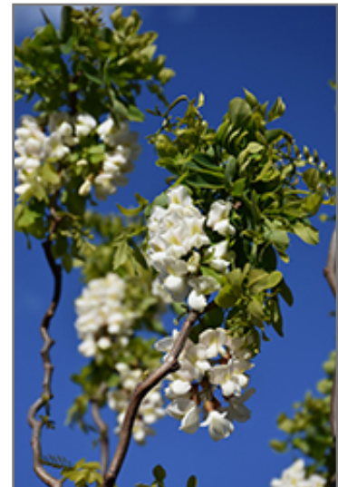
Twisted Baby Black Locust flowers