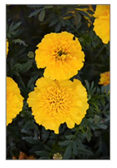
Bonanza Yellow Marigold flowers

Bonanza Yellow Marigold features bold semi-double yellow pincushion flowers at the ends of the stems from late spring to late summer. The flowers are excellent for cutting. Its fragrant ferny leaves remain dark green in colour throughout the season.