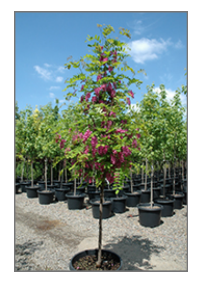
Purple Robe Locust in bloom