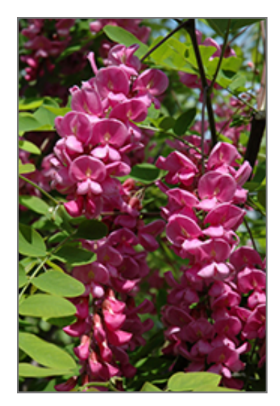
Purple Robe Locust flowers

Purple Robe Locust is recommended for the following landscape applications;