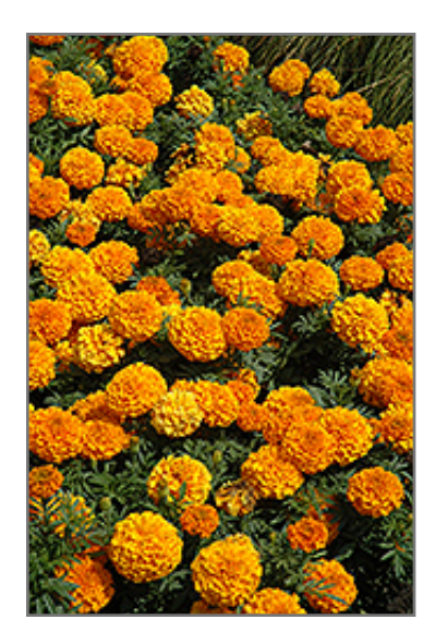
Taishan Orange Marigold flowers