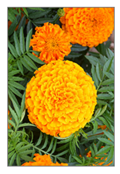
Taishan Orange Marigold flowers